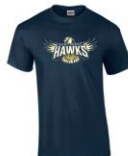
Gildan Short Sleeve T-Shirt (Hawthorne Hawks)